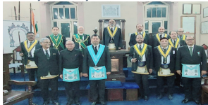
Truly Masonry knows no boundaries

Between 12 th and 15 th of August 2023, we, from the District deemed it essential to visit Nagpur to revitalize the Lodge to its pristine glory and what an event it was!!!! To our utter surprise, in a show of true fraternal solidarity,