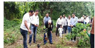
Greenery is essential

DGM and myself were pleasantly surprised to find ourselves as the Chief Guest and Guest of Honour respectively. Prior to the ensuing refreshments, saplings were planted at our hands in the compound, keeping the ecological green environment in mind.