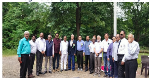
Flag Hoisting on Independence Day

With the National Independence Day coinciding on our day of return, the local Brethren across Constitutions assembled at the Freemasons' Hall grounds to hoist the National Tricolour.