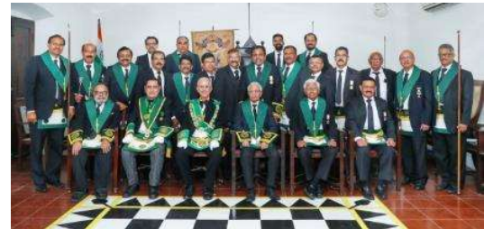
Lodge Imperial Brotherhood on Installation day 06.03.2024

One of the most striking aspects of the Masonic visit was the symbolism woven into every facet of the lodge. From the intricate designs adorning the walls to the solemn rituals conducted within, each element served as a reminder of the fraternity's venerable heritage and enduring values. Beyond the rituals and symbolism, what truly resonated with me during the Masonic visit was the sense of belonging fostered within the fraternity.