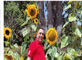
Magnanimous size of the Sunflowers

The banquet to ensue was attended by nearly a hundred, including invitees and families and turned out to be a gourmet befitting a connoisseur's delight.