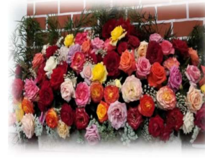
Floral decorations at the Banquet