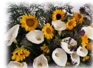
No dearth of Flora and fauna in nature's lap