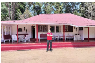
A morning of relaxation amidst nature