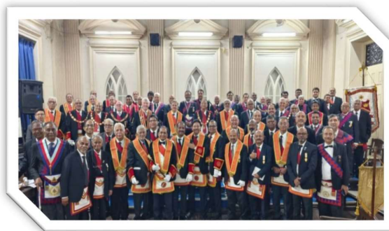
The gathering at the Provincial Grand Lodge of Ireland in India