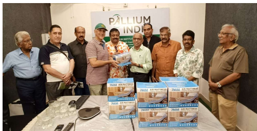
Ten pieces Air Mattresses donated by Brethren of Trivandrum to Pallium India at the hands of the DGM- 6 th March 2024

Freemasonry transcends boundaries of race, religion, and social status, welcoming individuals from all walks of life into its fold. It is a place where differences are celebrated, and unity is forged through shared ideals and mutual respect. One of the important tenets of Freemasonry is the attribute of Charity practiced by it. In a world often divided by strife and discord, the inclusivity of the charitable inclination of Freemasonry serves as a beacon of hope, reminding us of the inherent goodness that lies within each of us.